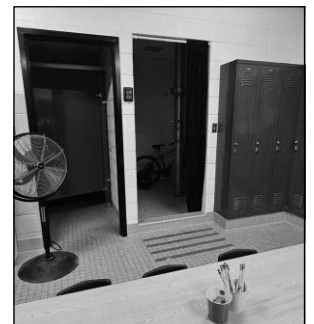
Paris School Facilities Committee members noted the Paris School girls' locker room converted to classroom space.

At present, the committee has identified specific facilities needs and the group is working toward conceptual plans to recommend to the Paris Jt. 1 Board of Education. We greatly appreciate the time, dedication, and expertise of all Paris School Facilities Committee members!